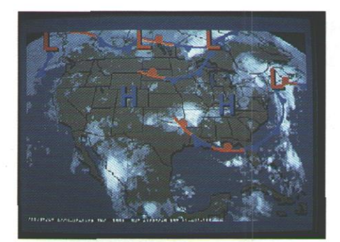
Original Satellite Image